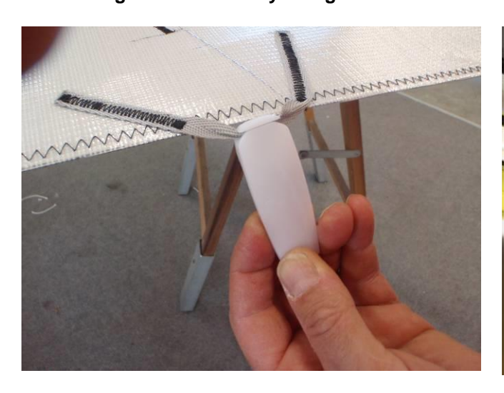
Figure 5-1: EasyFit Tighteners