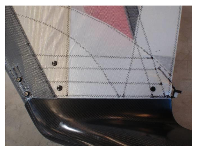
Figure 5-3: Wing Tip Fin Fasteners