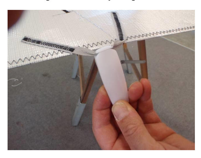
Figure 5-1: EasyFit Tighteners