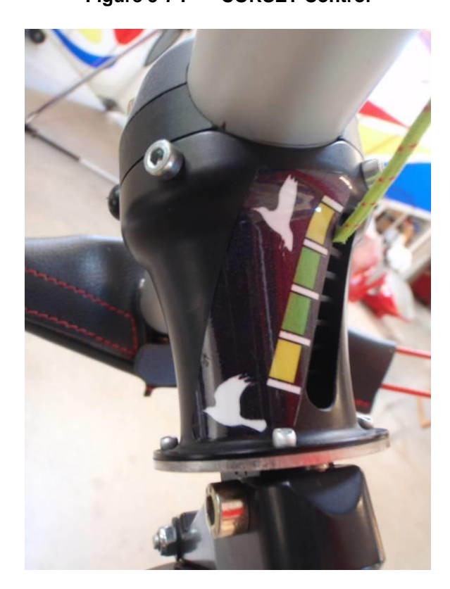
Figure 5-7: CORSET Control

On the ground, the CORSET control lever should be left in the slow position to limit tension on the sail.