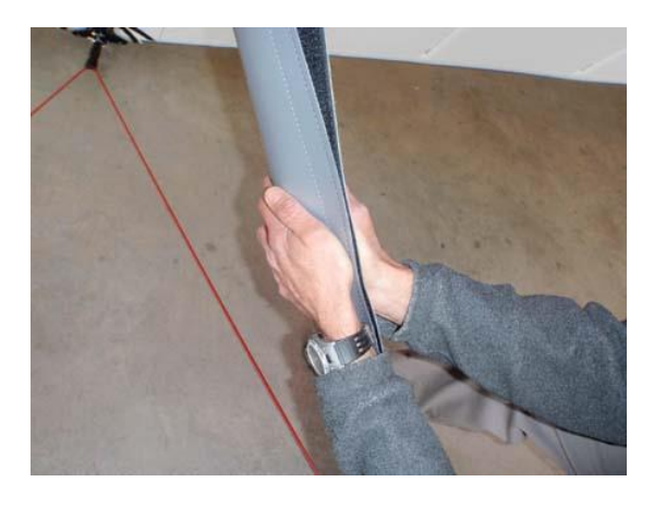
Figure 5-5: Placement of Fairings